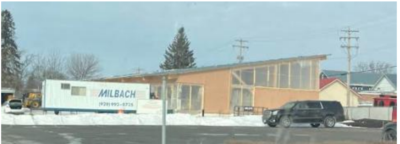
Construction crews are working hard despite winter weather, photo taken January 2026