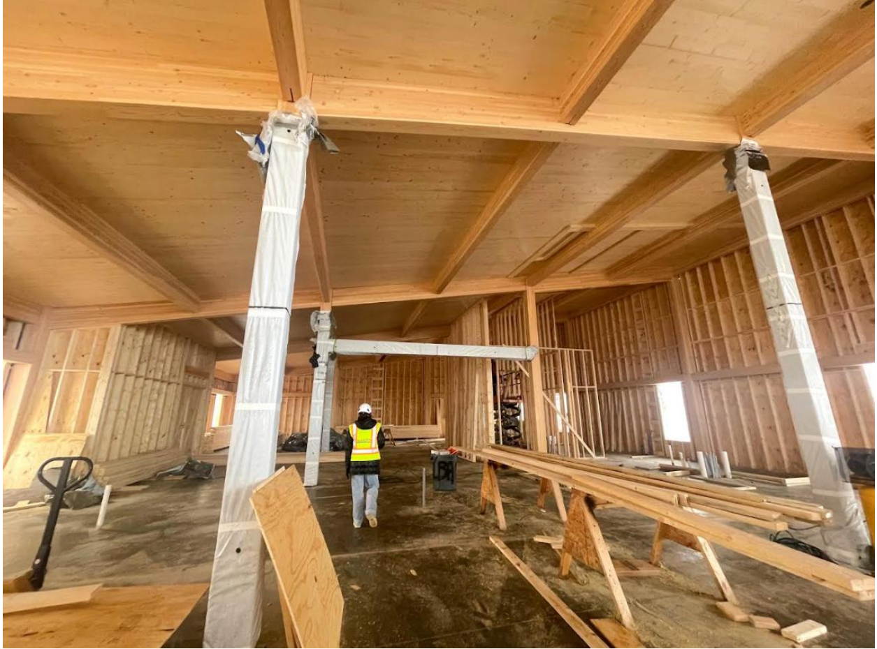
Continued interior work.