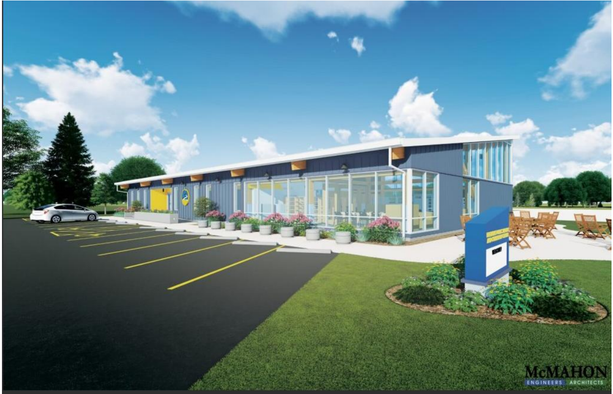
Updated building renderings as of January 2026